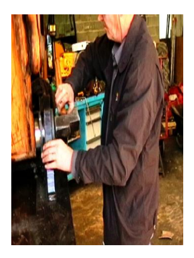
Pic 3: Measuring the mid line of adapter.

Adapter will be raised and rotated against sticks booms under plate. Care must be taken that the Adapter and Stick are properly aligned.