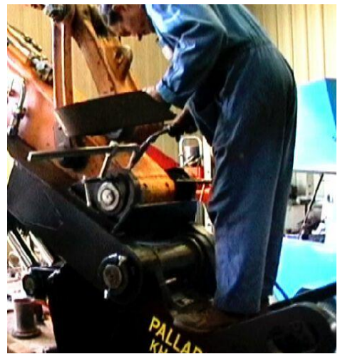
Pic 4 Adapter rotating / lifting

Adapter will be raised and rotated against sticks booms under plate. Care must be taken that the Adapter and Stick are properly aligned.